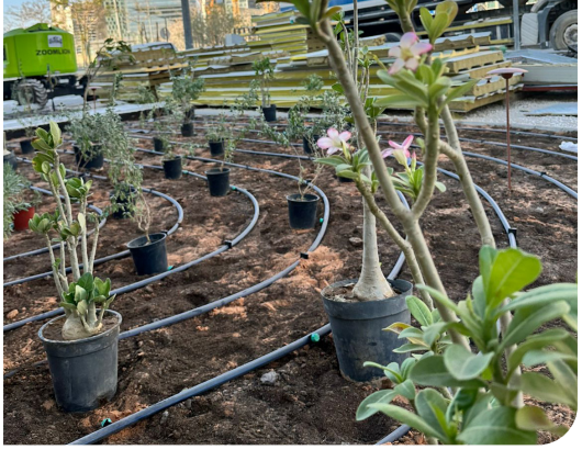
king Abdullah Financial District (Softscape)