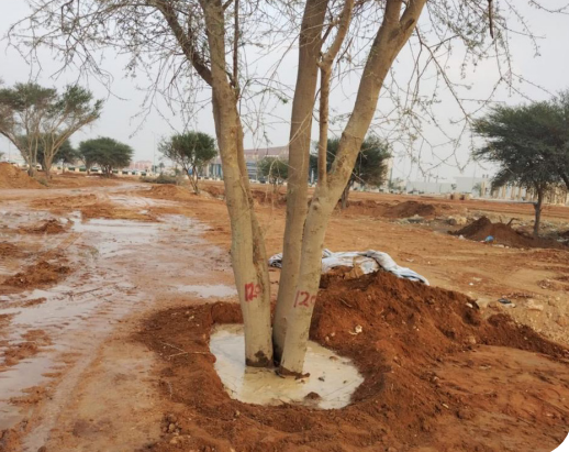
Roshen Project – Alomer Company (Tree transplant)