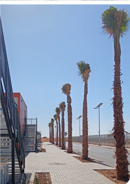
Washingtonia & Palm Tree